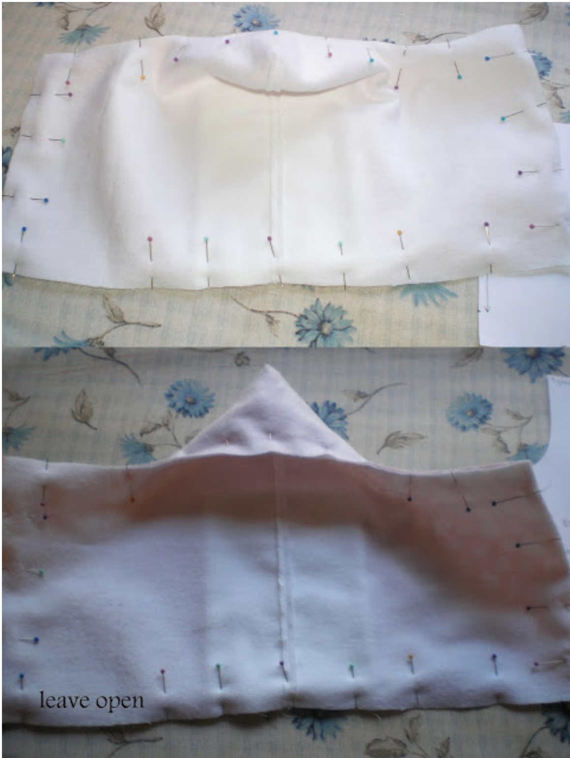
Pin around outer edges of wrap, including hood section.